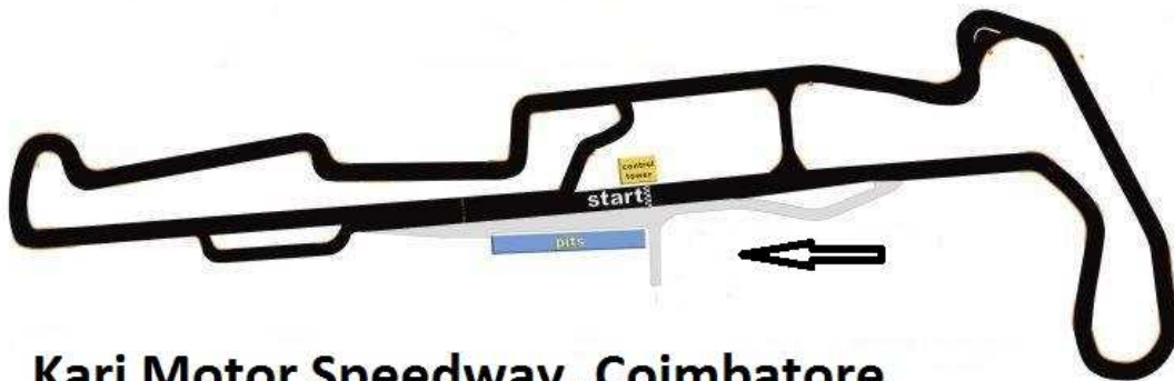
Kari Motor Speedway, Coimbatore