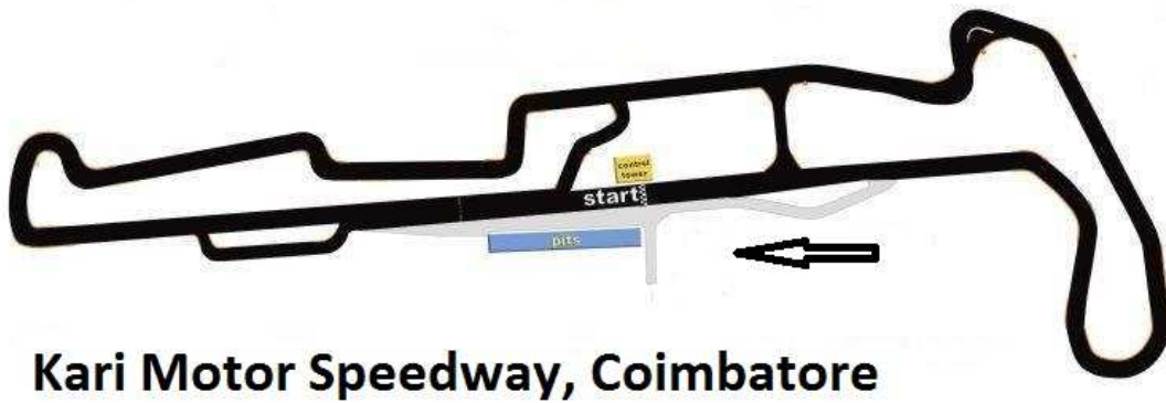
Kari Motor Speedway, Coimbatore